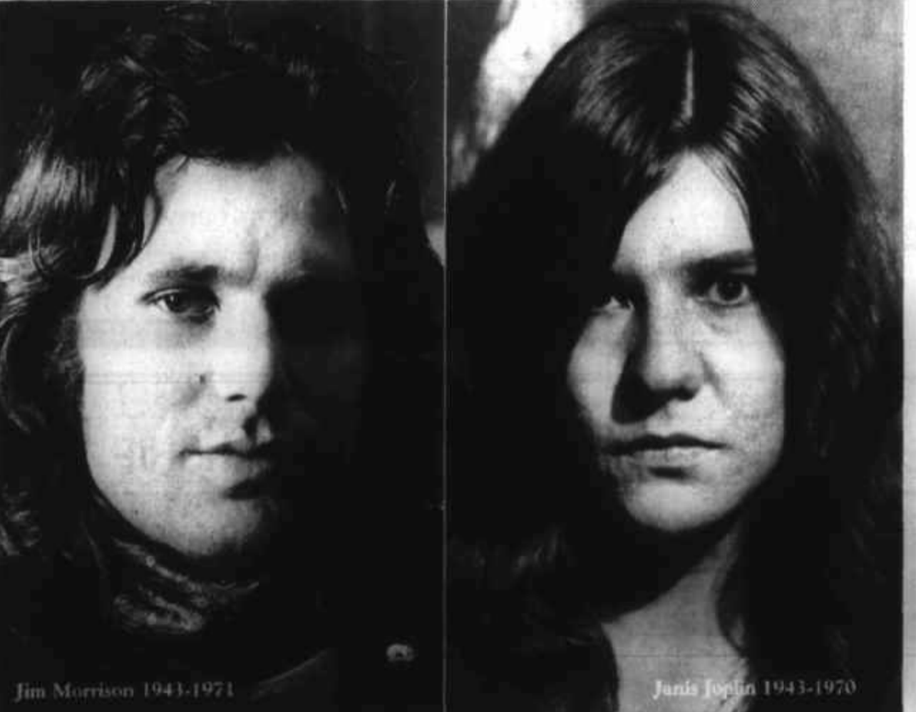
Jim Morrison 1941-1971 Janis Joplin 1943-1970